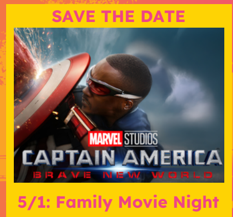
5/1: Family Movie Night