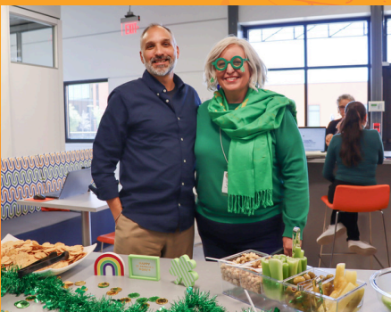
3/17: St. Patrick's Day Green Bite Social