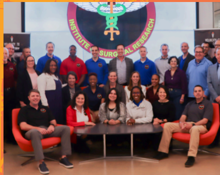
3/25: Hosted USAISR Strategic Planning Mtg.